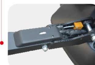
Wire Harness Fixing Block