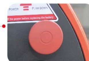
Emergency Power-off Switch